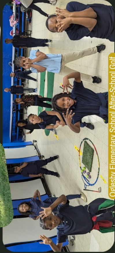
Oglesby Elementary School After-School Golf

Through a collaboration with GAGDC (Greater Auburn-Gresham Development Corporation), JPGA teaches golf to K-8 students in an afterschool class in Chicago Public Schools in the Auburn-Gresham neighborhood.