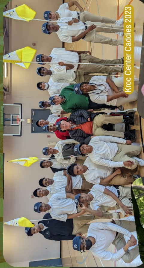
Kroc Center Caddies 2023

One of the major keys to prevention programming is the creation of alternative programming. The objective is to develop new skill sets and introduce underrepresented youth to alternative programming by introducing them to golf. The typical sports that dominate urban culture are basketball, baseball, soccer and football. Our objective is to present children with an additional career path.